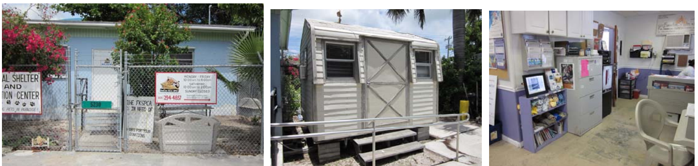
(Daily operations are hindered by our cramped quarters)