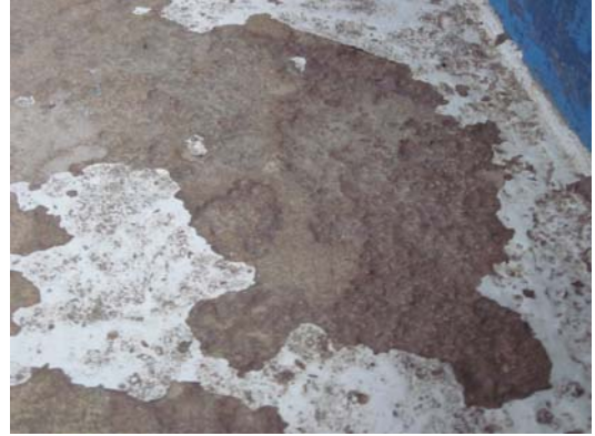
(Kennel floors are badly pitted, hindering disease control)