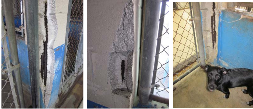
(FKSPCA staff daily find chunks of concrete on the floor from our crumbling walls)