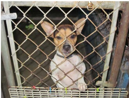
(Rusting chain link must be reinforced for the safety of the animals)