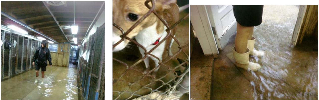
(Our current kennels flood routinely during common thunderstorms )