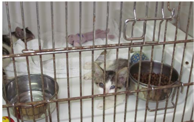
(Healthy animals share the same ventilation system as sick animals, compromising disease control)