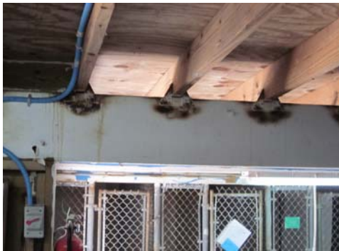
(Ceiling and insulation had to be removed due to serious rat infestation. Note trail around beams from rat travels)