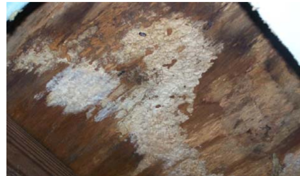
(Our ceilings and roofs are rotten and leak badly)